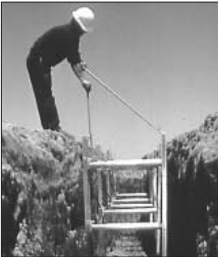
1. Use the removal tool to release the pressurized hydraulic fluid.