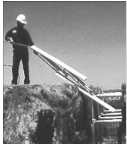
3. Walk backward while pulling the shore out of the trench.