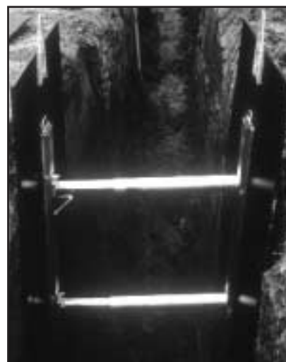
Finform is used to control local raveling and sloughing of the trench walls.

Finland – will be required between the rails and the soil. The finform is used to control raveling or sloughing of the trench walls. It is not considered a structural member. In some cases, the use of