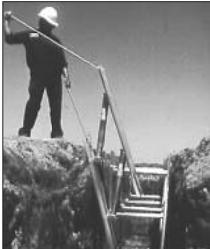
2. Use the release hook to collapse and lift the shore.