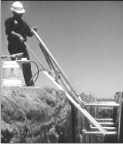
1. Connect hydraulic hose from pump, and lower shore into trench.