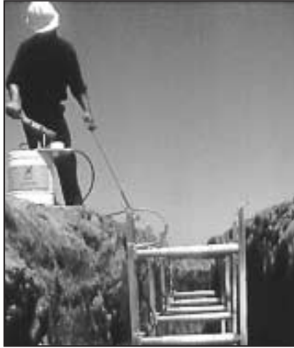
2. Pump the hydraulic pressure in the shore to minimum pressure of 750 psi.