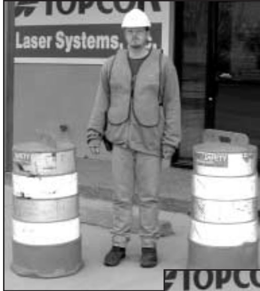
Standard Orange Vest

Additional information about these guidelines are available at www.ansi.org and www.safetysupply.com