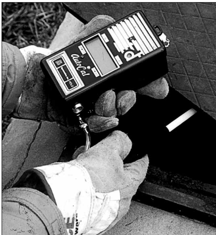
It is critical to check the atmosphere in every confined space, even after ventilation, to make certain it is safe.

In April 2004, OSHA issued a Safety and Health Information Bulletin (SHIB 05-04-2004) in which the ISEA recommendation was recognized as a