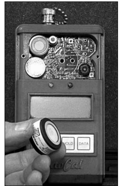
The person is holding the oxygen sensor. On the detector you can see where this sensor plugs into the circuit board.

Fuel-cell type sensors get “used up” over time. As oxygen enters the sensor, a metallic (lead) anode is oxidized. When all the lead (Pb) in the sensor is converted to lead oxide (PbO 2 ), the sensor must be replaced. Even if the gas detector is in the “off” position, the sensor is still being used. Life expectancy of an oxygen sensor is generally one to two years, or, in the case of one brand, three years. Be sure to check the manufacturer’s warranty to determine the life expectancy of the oxygen sensor.