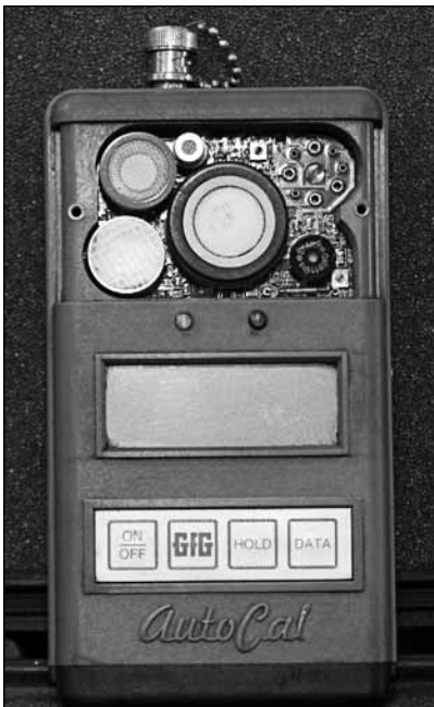
This gas detector utilizes four different sensors to monitor various gases.

Gas detectors use sensors to measure the contents of atmospheres. Those sensors respond to the