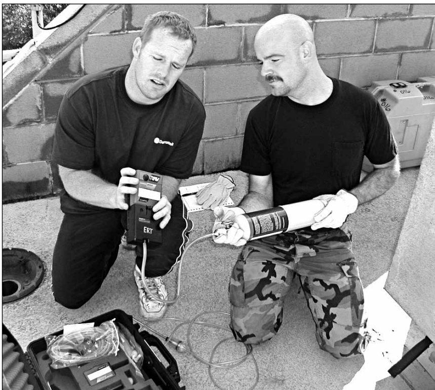
Periodic “bump” tests and calibrations —ALWAYS completed according the manufacturer’s instructions — are absolutely necessary to ensure the accuracy of all your detectors.

As we saw in the chart on page 1, oxygen makes up 20.9% of normal air. OSHA says that atmospheres with less than 19.5% or more than 23.5% oxygen are hazardous. Most gas detectors will sound and show an alarm when the level of